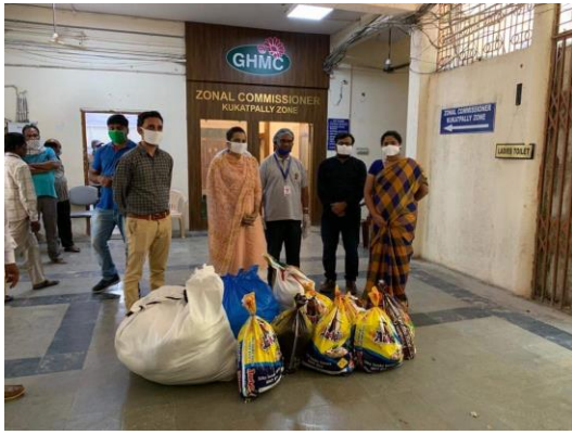
Covid Relief ii