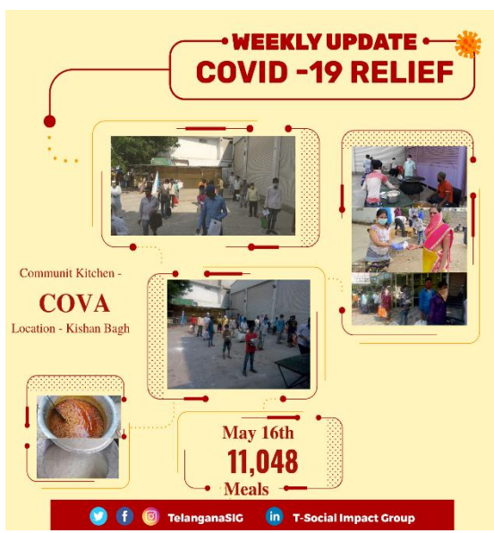
Covid Relief vii Community Kitchen