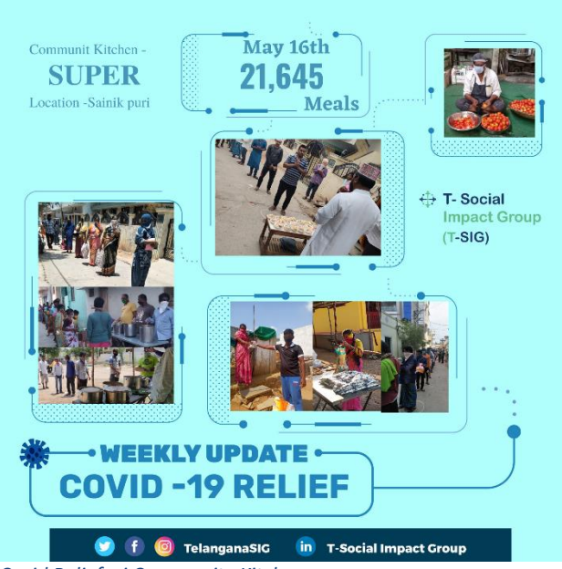
Covid Relief vi Community Kitchen