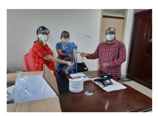
Covid Relief iii