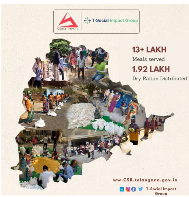
Covid Relief v