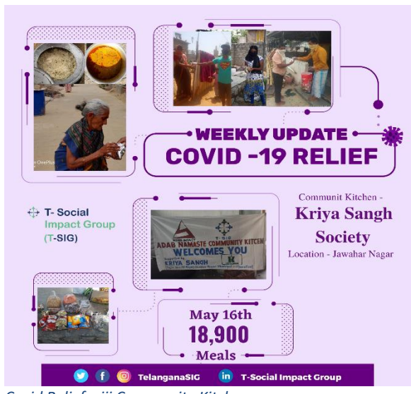
Covid Relief viii Community Kitchen