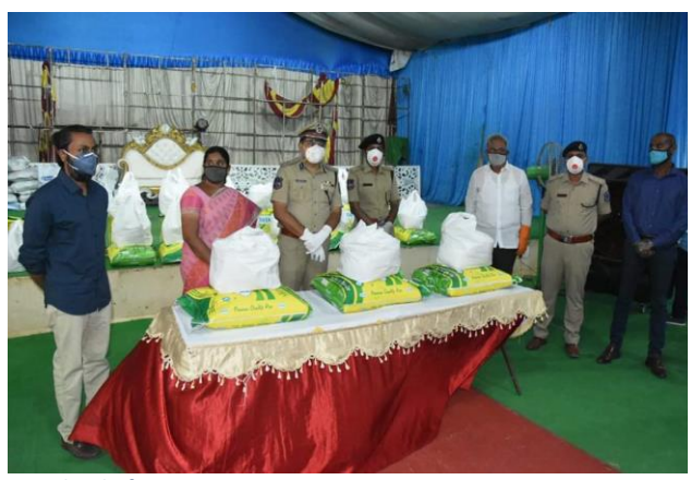
Covid Relief iv