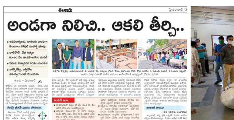
Covid Relief i