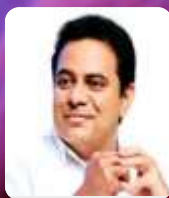
SRI K T RAMA RAO The Hon'ble Minister for Industries Textiles, Municipal Administration & Urban Development and NRI Affairs

An Integrated World Class Destination for Textile Value Chain