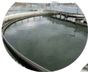
Effluent Treatment Plant with ZLD