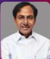
SRI K.CHANDRASHEKAR RAO The Hon'ble Chief Minister