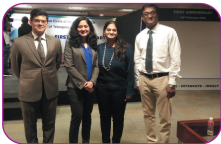
RICH directors of 3 focus sectors at the one year anniversary function along with team member

The Research and Innovation Circle of Hyderabad celebrated its one year anniversary on 24th February 2018. The RICH initiative aims to facilitate a network of top research institutions, academic institutions, scientists, mentors, funders and entrepreneurs in order to undertake important activities for progress of the state. The function was graced by the presence of Shri KT Rama Rao, Minister for Industries, who gave a rousing speech to commemorate the occasion.