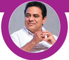
Shri KT Rama Rao Hon'ble Industries Minister