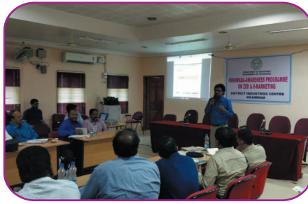
Pakhwada session at Khammam district