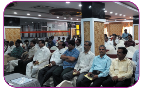
Pakhwada session at Mahbubnagar district

The Pakhwada sessions were conducted by GMs of District Industry Centres of 10 districts namely Mahbubnagar, Rangareddy, Nalgonda, Khammam, Mancherla, Karimnagar, Nizamabad, Hyderabad, Sangareddy and Warangal for the benefit of local entrepreneurs. These sessions included presentation by the National Productivity Council on increasing productivity in industries, followed by a session by Quality Council of India on the ZED scheme. In addition, the Quality Council of India also facilitated ZED registrations for entrepreneurs. The last session on GeM portal was conducted both for entrepreneurs (sellers) and government officials (buyers). The events began on April 9th and concluded on April 26th across 10 districts in telangana.