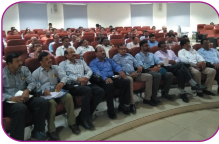
Pakhwada session at Rangareddy district