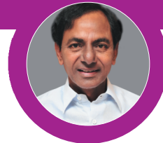
Shri K Chandrashekhara Rao Hon'ble Chief Minister