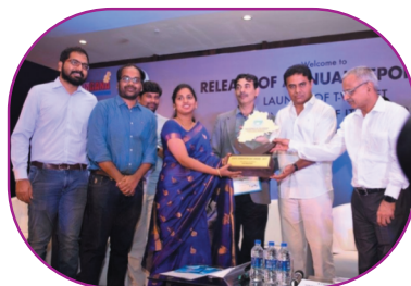
I&C Minister Shri KT Rama Rao hands out an award to entrepreneur at the function

The upcoming electric vehicles policy aims to establish Telangana as a leading state in the Electric Vehicle space through policy framework which will bridge gaps in the supply side and demand side. The main focus areas for supply side will be R&D, innovation and skilling, whereas focus areas of the demand side are simulating demand for electric vehicles and developing the required charging infrastructure and power back-up.