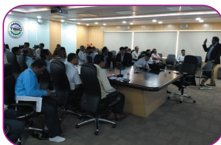
Cluster workshop with GMs at TSIIC boardroom conducted by consultants from Grant Thornton aided by case illustrations from MSME industries

The event was conducted by CoWE in association with the industries Department, which included a session on usage of cloud computing technology in MSMEs for managing data. The Digital Marketing session was conducted by digital marketing experts who explained the uses of social media platforms and websites to promote products or services.