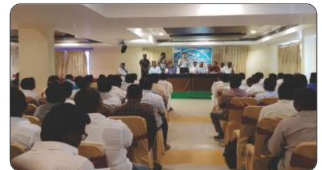
Karimnagar - 1st August 2018

etc. In the upcoming weeks, similar workshops and seminars will be conducted in Nizamabad, Khammam, Warangal, Adilabad and Mahbubnagar.