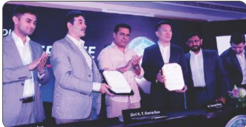
Benelli, an Italian Motorcycle Manufacturing Company, signed an MoU with Govt of Telangana to set up Indigenous Manufacturing Plant in the State. The MoU was signed in the presence of Minister Shri K.T. Rama Rao.