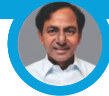
Shri K Chandrashekar Rao Hon'ble Chief Minister