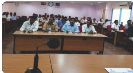
Nalgonda- 28th July 2018

NSSH awareness sessions were conducted in Nalgonda and Karimnagar districts to update knowledge of SC/ST entrepreneurs regarding latest developments, technology trends, quality standards