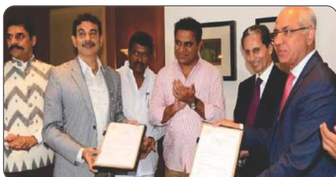
MoU exchange between Jayesh Ranjan, Prl. Secretary, I&C Dept. and an official of C.K. Birla group for expansion of Orient Cements in Telangana in the presence of Industries Minister, K.T. Rama Rao. Orient Cement will invest Rs. 2,000 Cr. to boost its capacity from 5mtpa to 8mtpa, resulting in creation of 4,000 direct and 4,000 indirect employment.