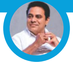
Shri K T Rama Rao Hon'ble Industries Minister