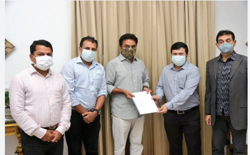
Procter & Gamble contributed Rs. 5 Crore towards vaccination of citizens in Telangana