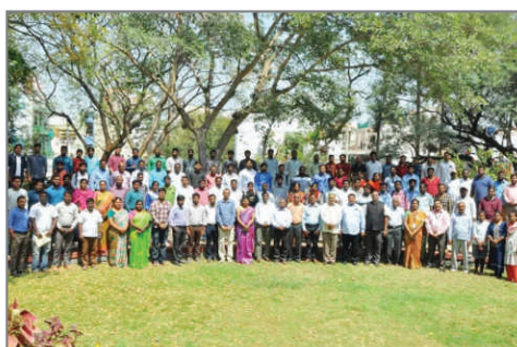
NI-MSME, Hyderabad - 26th February – Awareness Program