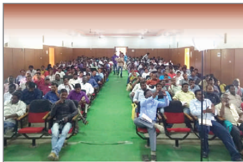
Nizamabad-11th February – Awareness Program

Ministry of MSME has allocated Rs. 2 Crore for conducting awareness sessions, vendor development programs, exhibitions and skill training for the development of SC/ST Entrepreneurs at district level.