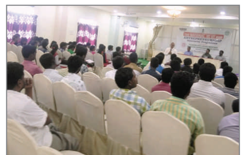
Jangaon - 2nd March – Awareness Program