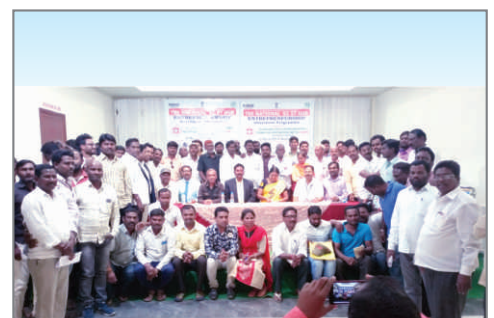
Mancherla - 1st March – Awareness Program