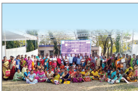
Adilabad - 27th 28th February – Awareness session and Product exhibition