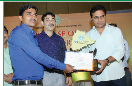
I&C Minister handing out award to entrepreneur during 2018 awards function