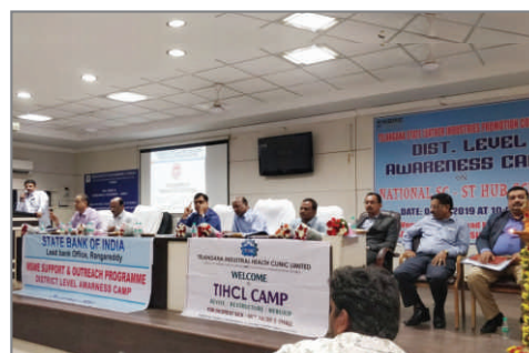
Rangareddy - 4th January - Awareness Camp