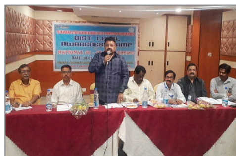
Khammam - 18th January - Awareness Camp