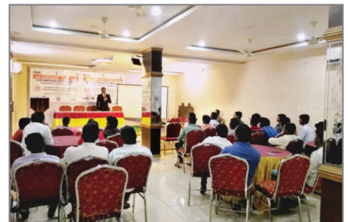
Nirmal - 28th February - Awareness Program