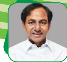
Shri K. Chandrashekar Rao Hon'ble Chief Minister