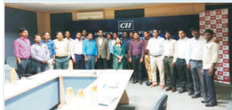
Participants at the Program