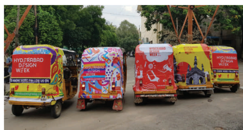
HDW Auto prints by artists organized by Indiefolio Network and supported by Govt. of Telangana