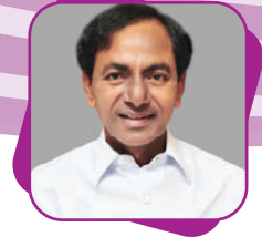
Shri K. Chandrashekar Rao Hon'ble Chief Minister