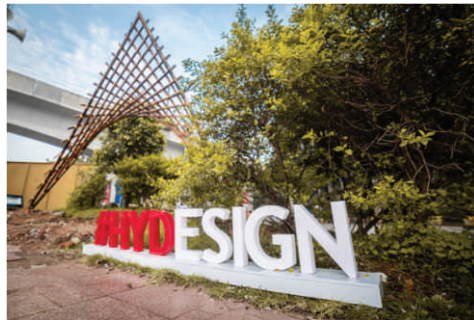
Designaware bamboo installation at Khairatabad traffic intersection