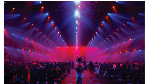
Opening act of Joint HDW and WDA Conferences on 12th Oct at HICC