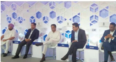
IT and Industries Minister, Mr KT Rama Rao participated in a line of meetings and sessions at the World Economic Forum's India Economic Summit 2019 in New Delhi on 03 October 2019

At the summit, Minister K T Rama Rao participated in a panel discussion on the 'Union of States'. The other panelists who shared their insights during the session were Amarinder Singh, Chief Minister of Punjab, Conrad Sangma, Chief Minister of Meghalaya, Kamal Nath, Chief Minister of Madhya Pradesh, and Mekapati Goutham Reddy, Minister for Industries, Commerce and Information Technology, Andhra Pradesh.