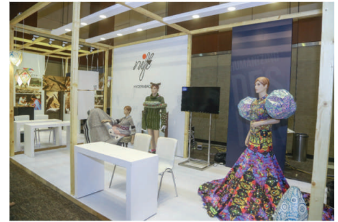
NIFT - student works display at Design Expo - HDW at HICC