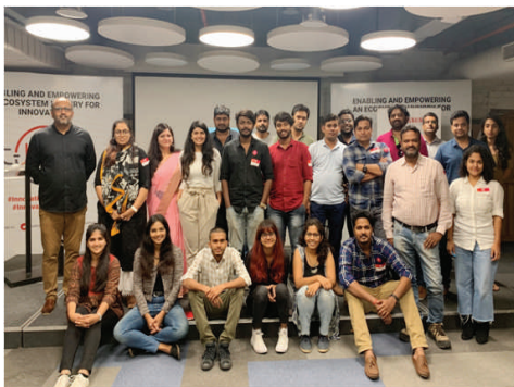
Design for impact on 9 Oct organized by NASSCOM at T-Hub