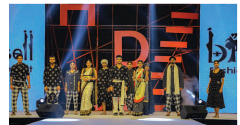
HDW Fashion show at Hitec on 12th Oct evening