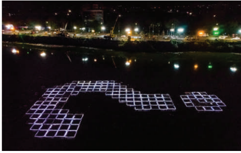
Installation at Hussain Sagar lake by St+Art Foundation India for raising awareness about plastic pollution using 3 lakh upcycled plastic bottles