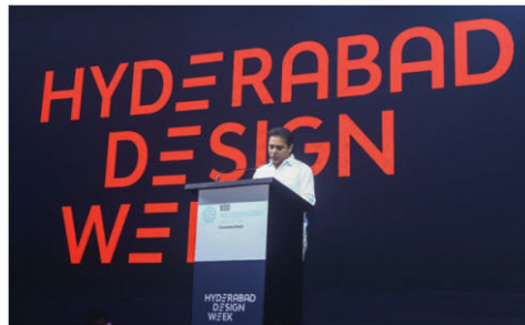
Shri K. T. Rama Rao, Hon'ble Industries Minister addressing the delegates of HDW and WDA on 12th Oct at HICC

The inaugural edition of Hyderabad Design Week (HDW)- a high impact citywide design festival which brought together world's leading design practitioners to present and explore the best in human-centric design innovation was hosted by the Government of Telangana, in partnership with India Design Forum (IDF) and the World Design Organisation (WDO) from 9-13th Oct 2019. Hyderabad Design Week also played host to the 31st edition of World Design Assembly (WDA) - the first time that this prestigious event was held in India.