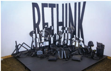
Installation at Design Expo - HDW at HICC