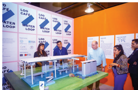
British Council stall on Loo Café 2.0 at Design Expo - HDW at HICC