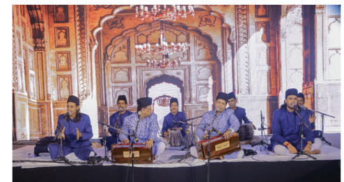
HDW Sufi music dinner event at Taj Falaknuma on 11th Oct evening