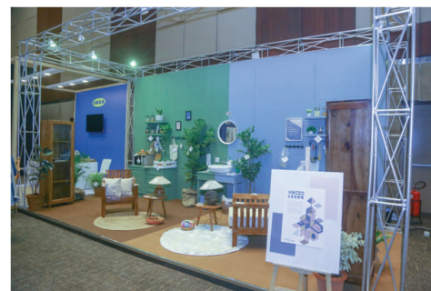
Unlearn and IKEA exhibits at Design Expo - HDW at HICC