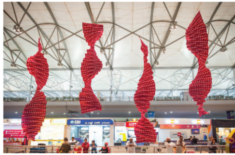
IKAT Twirl installation at Rajiv Gandhi International Airport at Hyderabad