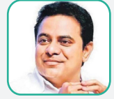
Shri K T Rama Rao Hon'ble Industries Minister