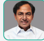
Shri K Chandrashekar Rao Hon'ble Chief Minister