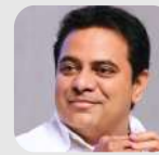
Shri K T Rama Rao Hon'ble Industries Minister