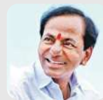
Shri K Chandrashekar Rao Hon'ble Chief Minister